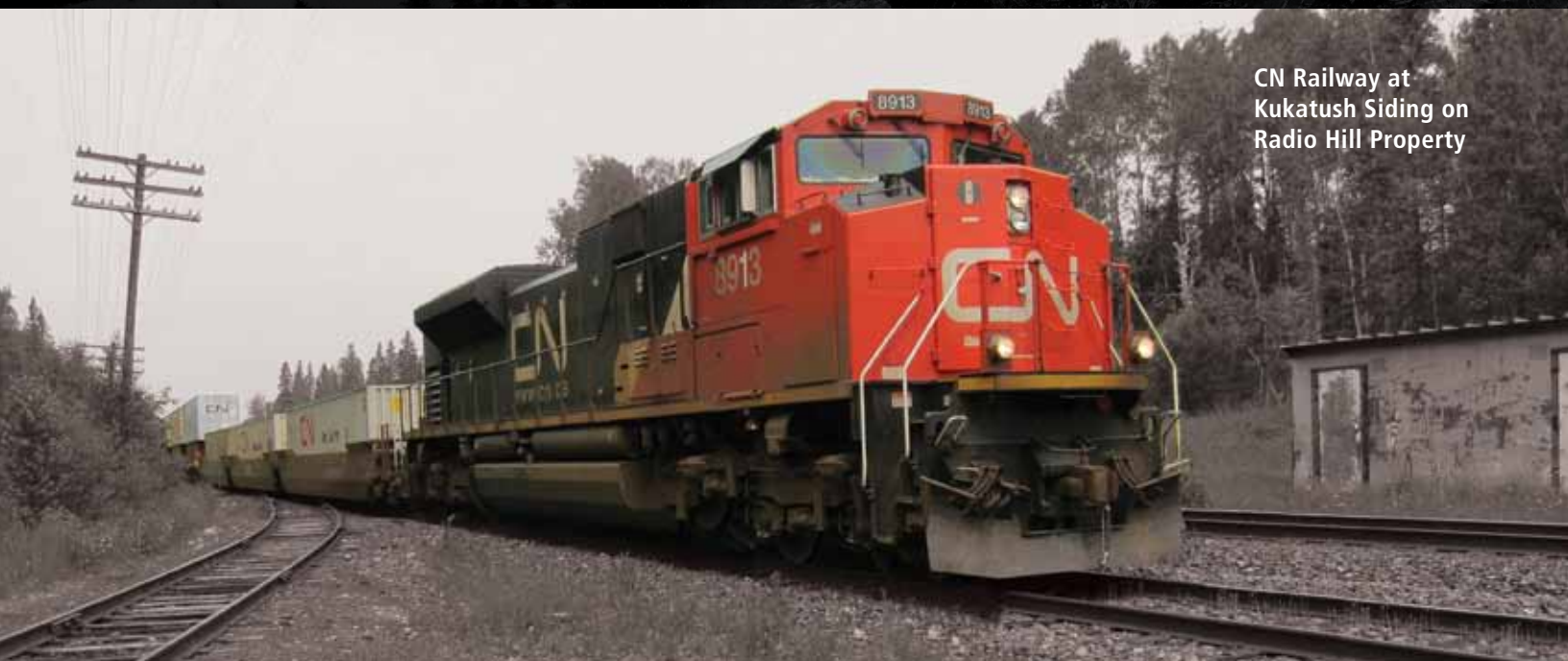
CN Railway at Kukatush Siding on Radio Hill Property